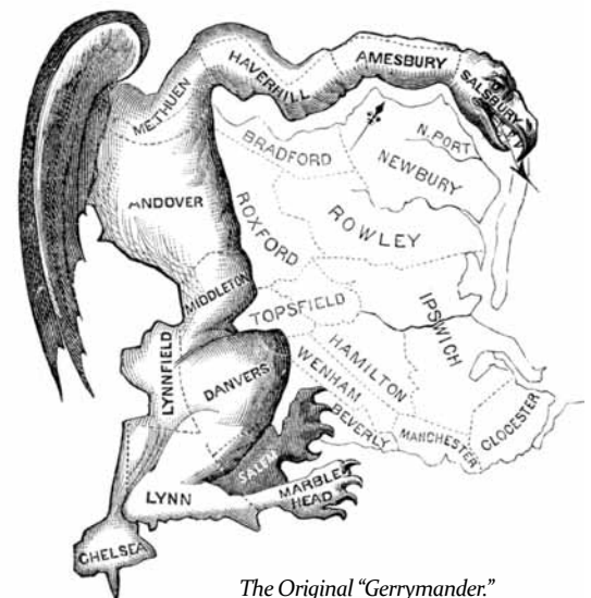
The Original "Gerrymander."