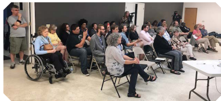
Between 40-50 people attended the forum